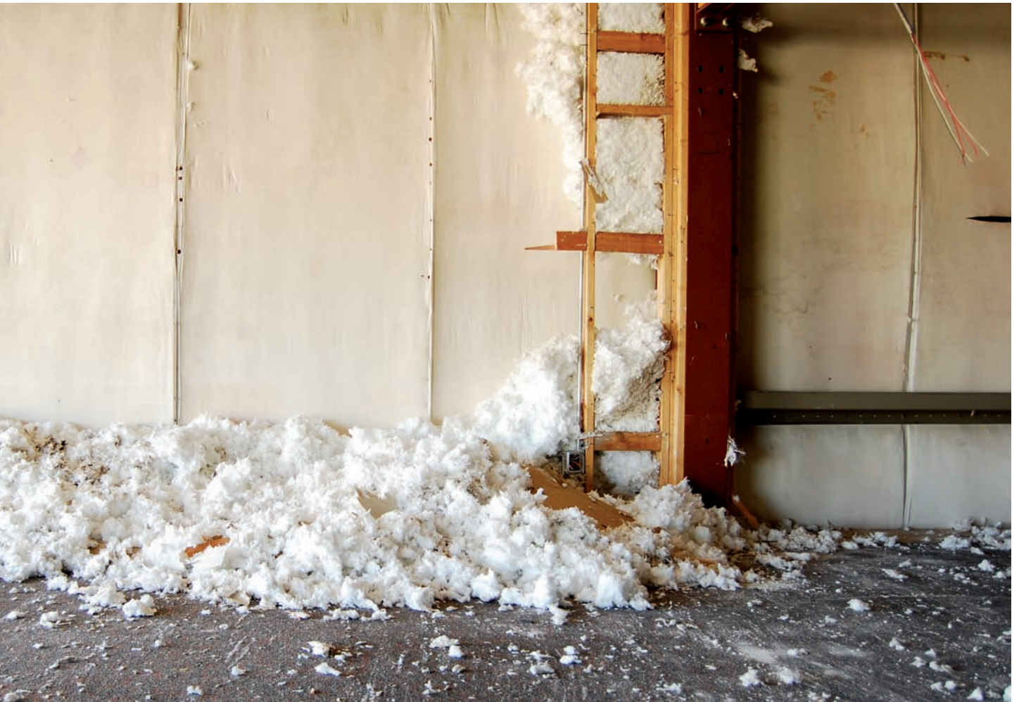
Retrofitting needs to be combined with a change in human culture to reduce emissions